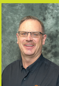
Dale Middle East