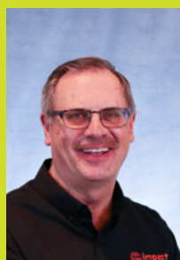
Dale Middle East