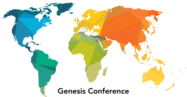
Genesis Conference 2023 Missions Giving through FMWM*